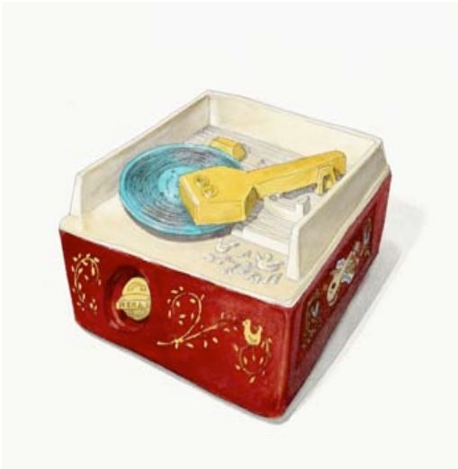
From Album, 2009